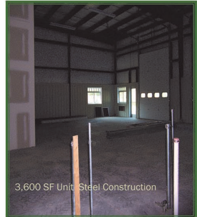
3,600 SF Unit Steel Construction

For Additional Information Call: 860-767-2654 or email : info@necp.biz