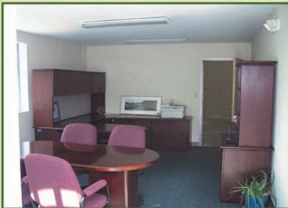
Office space configurations available